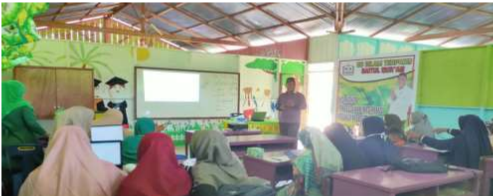
Figure 1.2. Submission of Materials on Making News

The third (last) form of assistance is evaluating the results of the material by practicing directly using blogs in an easy and simple way. This is of course supported by adequate hardware such as a laptop or computer, a smooth internet connection and an LCD Infocus to describe in detail to participants. Practice using bThe log is not only a place for doing business or sharing personal work to portfolios, the presence of blogs and websites also makes it easier for teachers to get new students to make schools popular on Google pages.