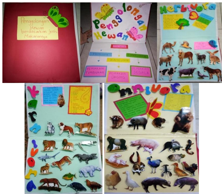
Figure 1. Pop Up Book Media

Learning by using Pop-Up book media is proven to improve student learning outcomes. As the results of research conducted by Ningtiyas, et al (2019) that the Pop Up Book media can improve the learning outcomes of Natural Sciences. Pop Up Book media used in this study can be seen in Figure 1